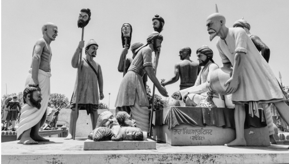
Sikhs have been cruelly persecuted throughout their history by governments of their time. Price was put on Sikh's heads by most governments of the time. (Museum of Sikh History at Gurdwara Mehdiana Sahib)